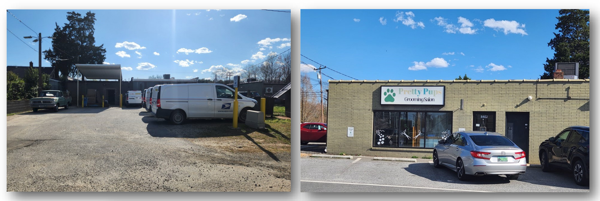
Additional parking behind Strip Center