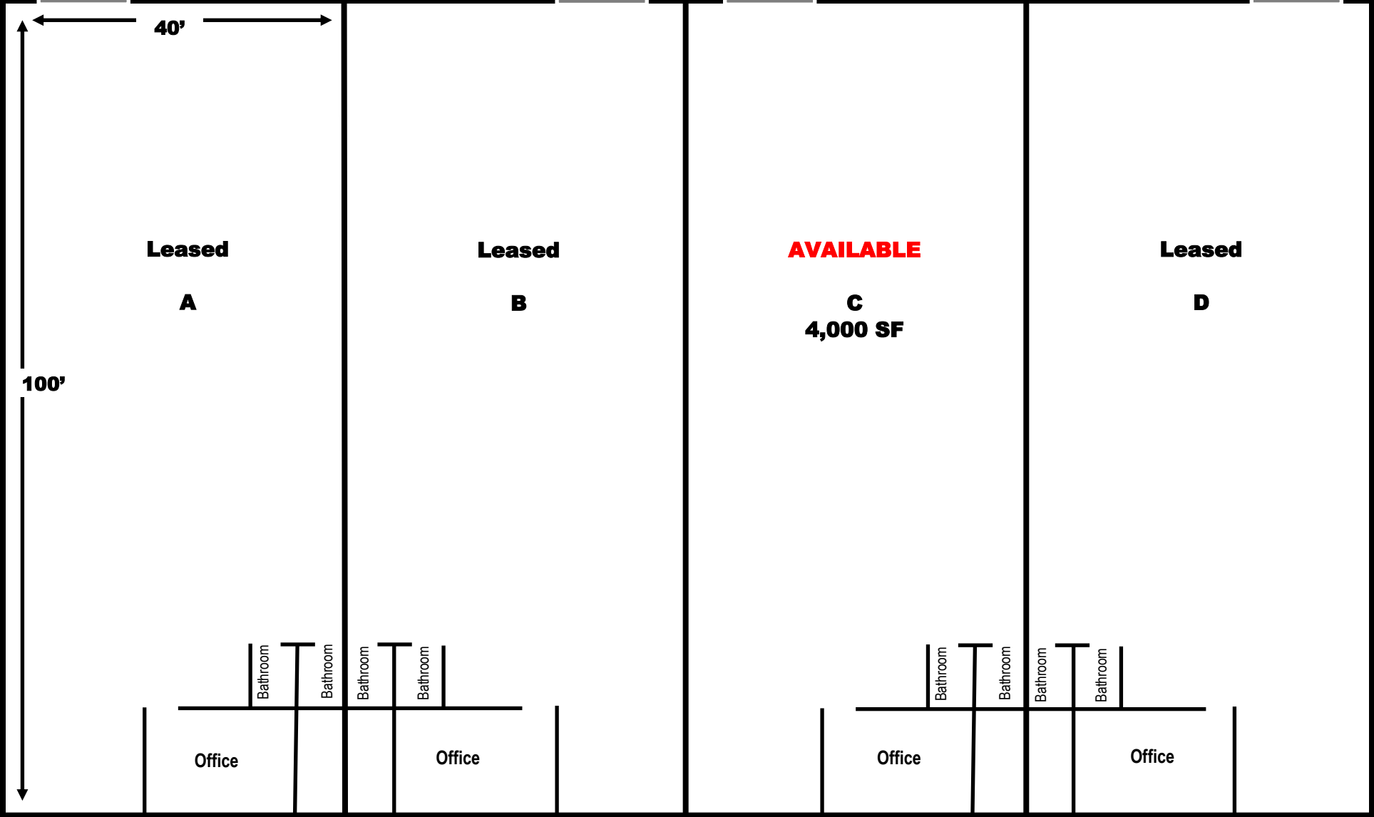
Available Space Options +/- 4,000 SF