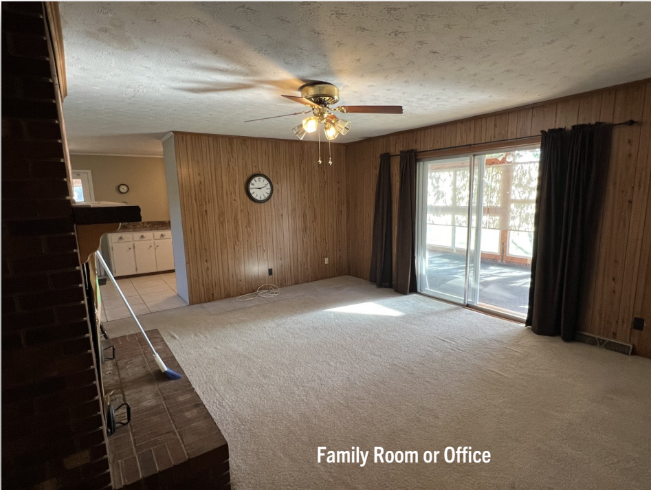
Family Room or Office