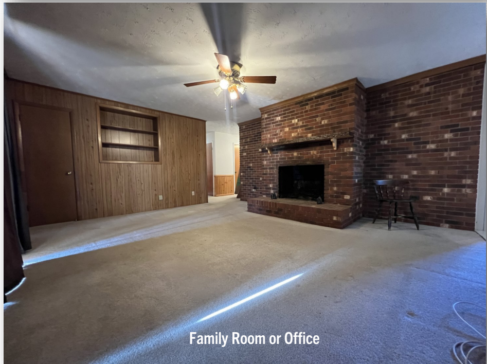
Family Room or Office