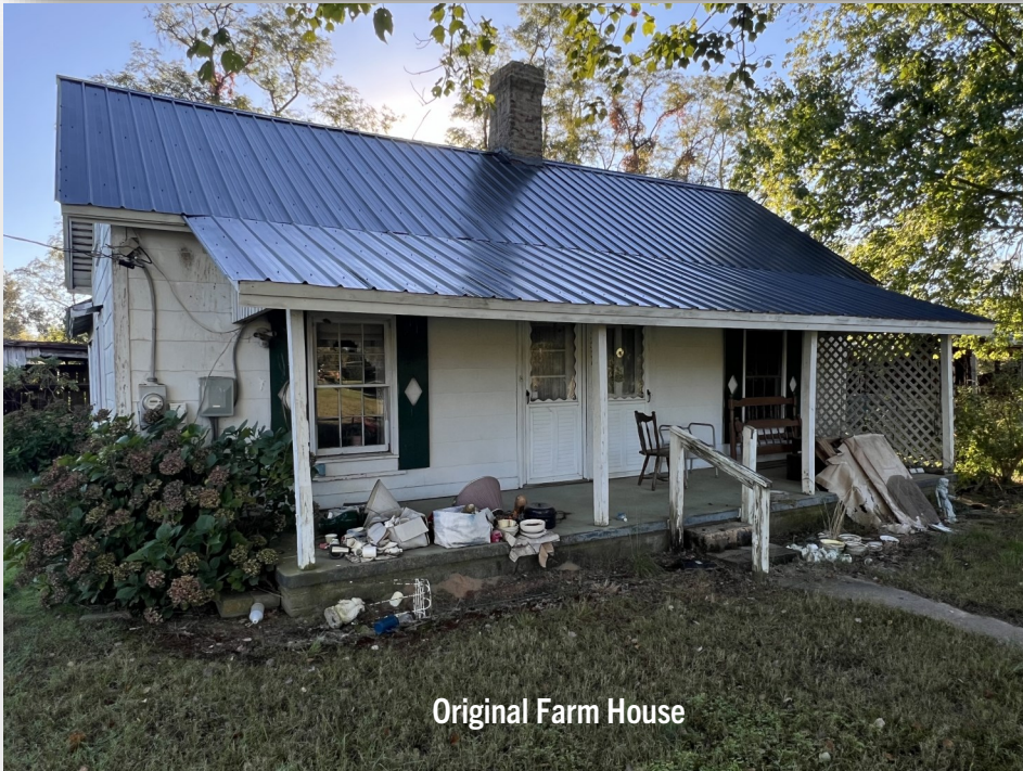
Original Farm House